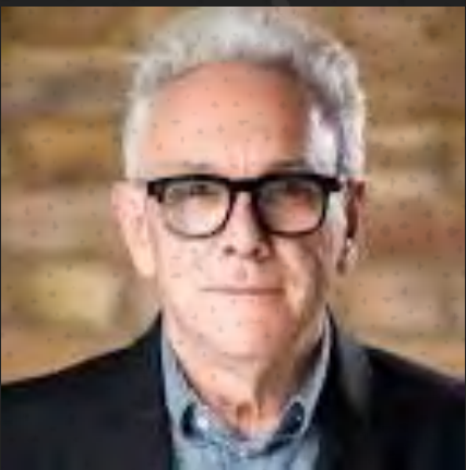
Trevor Horn CBE